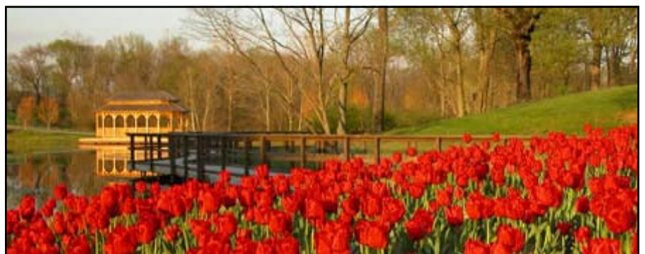
Gorgeous gardens and grounds of the Creation Museum

For those who feel a full day in a museum might be a bit much, take heart. This unique facility is surrounded by a 49-acre wooded property that features more than two miles of nature trails, beautifully themed botanical gardens, and a three-acre lake.