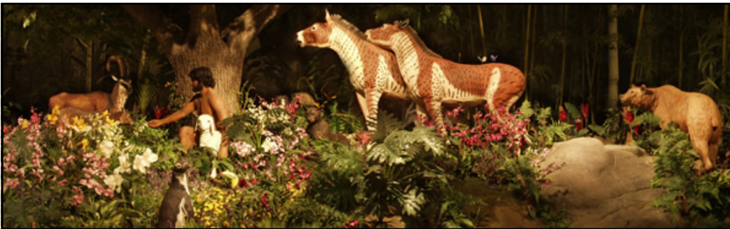
Exhibit from Creation Museum's Walk through Biblical History

The Answers in Genesis Creation Museum opened its doors in 2007 as a 60,000 square foot high-tech facility, filled with animatronic displays, striking videos, a state-of-the-art planetarium, and a Special Effects Theater. The museum goes beyond telling the compelling story of the creation of life on this planet to proclaiming