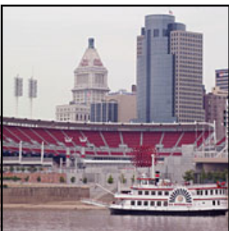
BB Riverboat Cruise

http://www.choicehotels.com/ires/pdf/en-US/IL074 http://www.hancock-observatory.com/en/index.html http://www.shorelinesightseeing.com/laketour.php