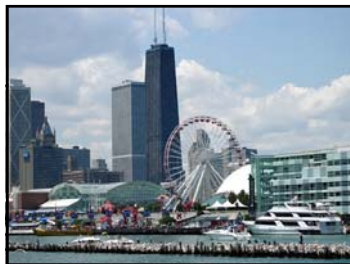
Chicago's Navy Pier

Departing from New Ulm bright and early en route to Chicago with passenger pick ups offered along the way (Mankato, Rochester, La Crosse, Tomah, Madison, Milwaukee, Kenosha). We'll check in our smoke free all-suite hotel (Comfort Suites) in Oak Brook, IL, then head downtown for dinner ($) and 3 hours on Chicago's magnificent mile. Stroll the streets on your own or opt to join a group for a Lake Michigan sunset cruise ($10-15) or ascent up the 1000 foot Hancock Tower ($10-15).