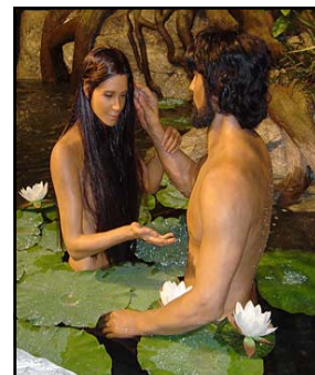
Adam and Eve

http://www.creationmuseum.org http://answersingenesis.org http://cincinnati.reds.mlb.com http://www.newportonthelevee.com