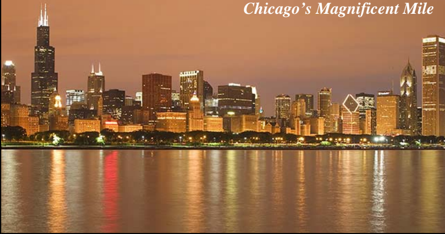
Chicago's Magnificent Mile